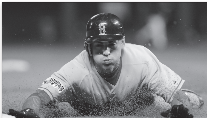
Jacoby Ellsbury became Oregon State's first World Series winner in 2007