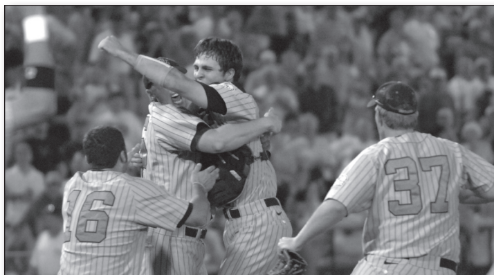
The Beavers celebrated their second consecutive national title in 2007